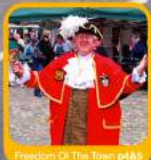
Freedom Of The Town p4&5