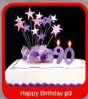
Happy Birthday p3