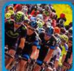
Tour of Britain p8