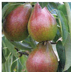
Louise Bonne of Jersey Pears

The fruit trees will not only provide a visual delight as they go through the seasons, they will also provide healthy fresh snack to the public. The trees can produce additional pollen for pollinators. Any fruit fallen from trees are fruit that has been eaten can be placed into a compost bin to make the gardens on compost.