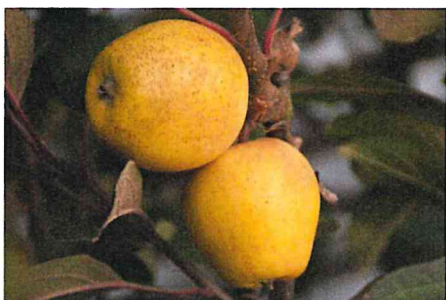
Pitmaston Pineapple apples