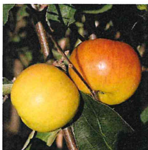
Chivers Delight apple